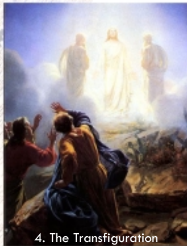
4. The Transfiguration