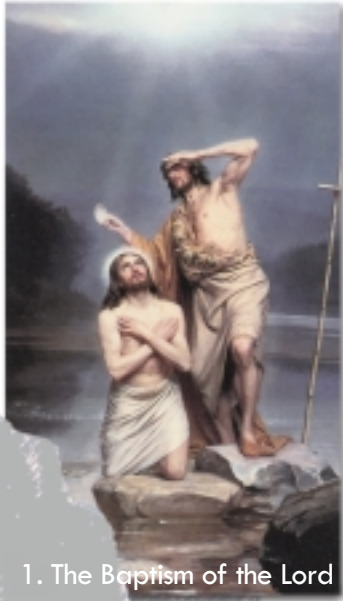
1. The Baptism of the Lord

Hail Mary, Full of Grace, the Lord is with thee, Blessed art thou among women and blessed is the fruit of thy womb, Holy Mary, Mother of God, pray for us now and always.