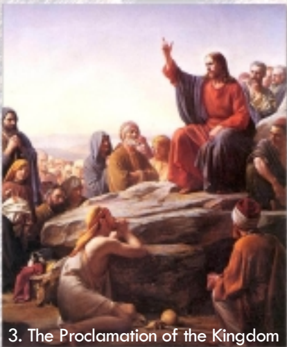
3. The Proclamation of the Kingdom

In his Apostolic Letter on the Most Holy Rosary, Pope John Paul II proposes five new mysteries which focus on the public ministry of Jesus Christ [#19 & #21]. These are called mysteries of light (or luminous mysteries) since in a special way they present us with Jesus Christ as the light of the world. They fall in sequence between the joyful mysteries and the sorrowful mysteries.