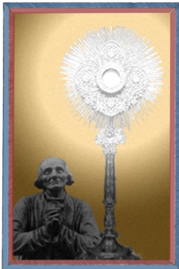
Illustration: Maronite Monks

would be always kneeling on the floor without any support, with a Rosary in his hand and his eyes fixed on the tabernacle. He slept but one hour a night and his diet consisted of cold potatoes, bread crumbs and water. You would always find him offering Mass, in the confessional or in adoration before the tabernacle. He rarely left Ars (no “days off”). All of this he did with one purpose in mind: the conversion of his parish. And so the transformation of Ars began.